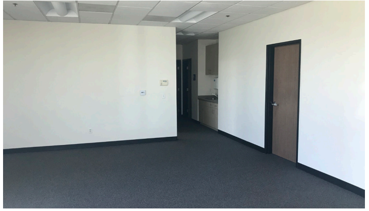
*Unit can be refurbished similarly to the above interior